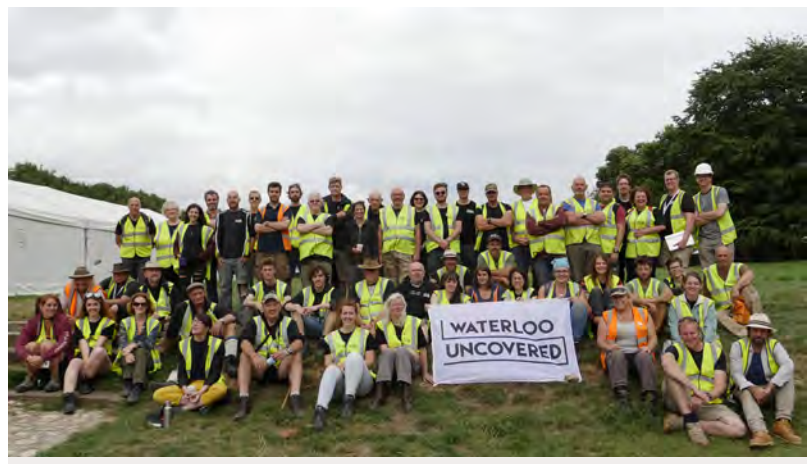
The 2017 team on the last day of the excavation.