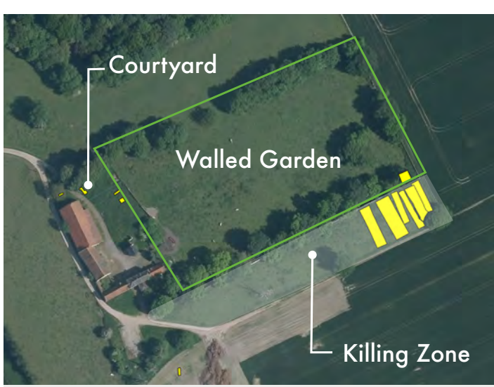
Map of the Hougoumont site, with the 2017 trenches.

• Waterloo Uncovered deliberately selects SPV with diversity in mind, to reflect the variety of issues faced by the military community. 77% of SPV had mental or physical injuries. Ages ranged from early 20s to late 70s. 29% of all participants were female and 71% male.