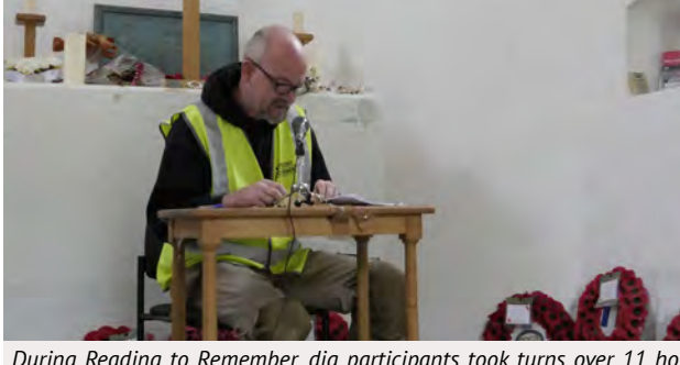
During Reading to Remember, dig participants took turns over 11 hours to read accounts of the battle in the chapel at Hougoumont.

Following the excavation, UCR students and Dutch veterans have remained in contact and are planning outreach work for the spring period, when many schools have project weeks.